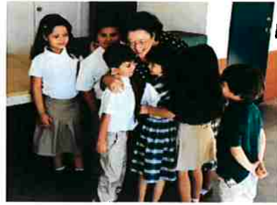
Saint Matthew Catholic School